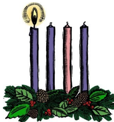
First Sunday in Advent

8:30 am Mass 8:30 & 9:15 CKCC 10:30 am Mass 5:00 pm HS Youth Group