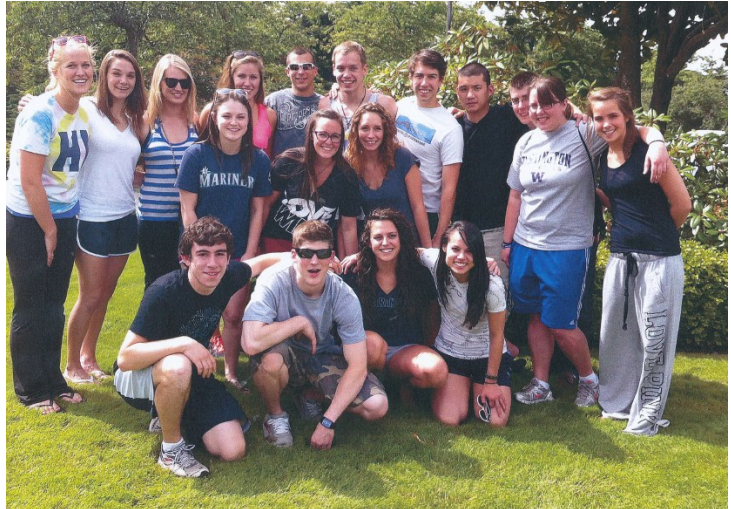
Young Adult Trek June 15-23, 2012