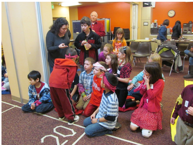
Catholic Kids' Catechism Club Meal Makers at Superbowl Sundae!

Seventh Sunday of Ordinary Time 8:30 am Mass NO CKCC—mid winter break 10:30 am Mass No Youth group or Confirmation—mid winter break